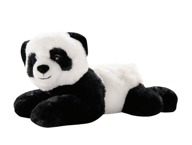
Small Plush 350 – 399 packages sold