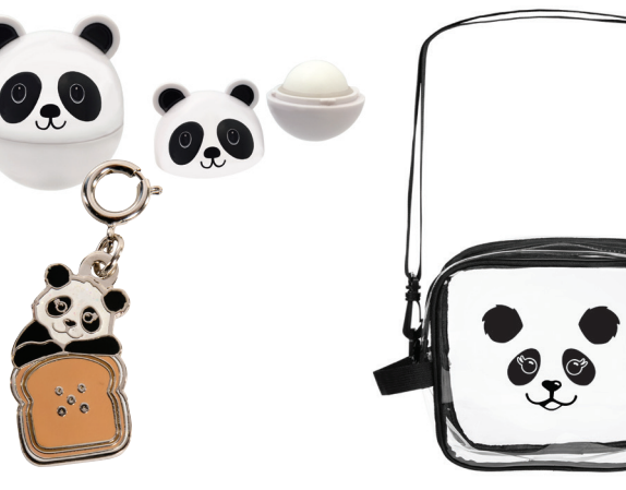
Panda Lip Balm and Charm Clear Crossbody Bag 250 – 299 packages sold 300 – 349 packages sold