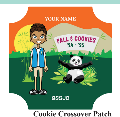
Need to have created a Fall Product avatar, send 18+ emails by Nov. 9, 2024 and now sell 250+ pkgs of cookies during the 2025 Cookie Program