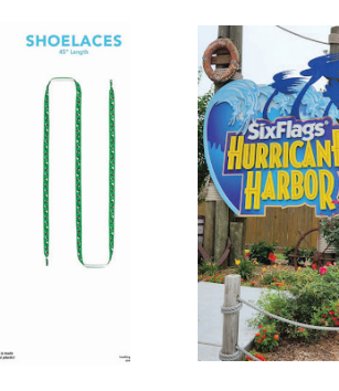
Hurricane Harbor (June 7) and Sports Bottle 1,500 - 2,024 packages sold