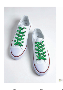
Converse Custom Shoes and Shoelaces 1,250 – 1,499 packages sold