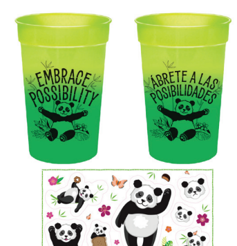
Mood Cup and Stickers 55 – 99 packages sold

Girls unable to attend the girl experiences will have the opportunity to select cookie dough in place of the event.