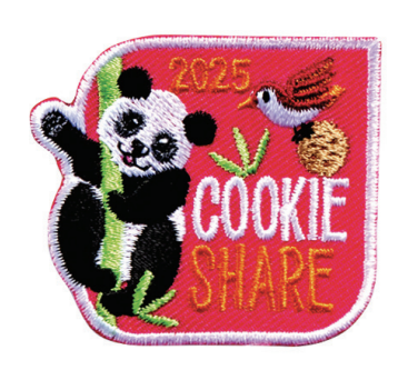
Cookie Share Patch 12 pkgs of cookies donated through Cookie Share