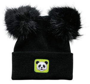
Panda Beanie 400 – 499 packages sold