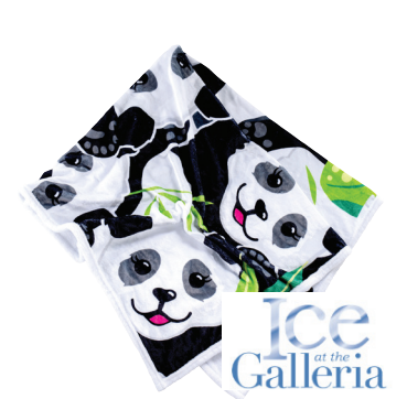
Panda Blanket and Ice Skating (June 29, July 13, July 20, OR July 27) 750 – 999 packages sold