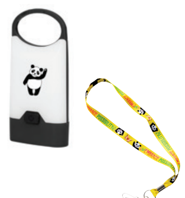
Clip Light and Lanyard 100 – 149 packages sold