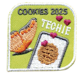
Cookie Techie Patch 12 pkgs of cookies sold via online direct-shipped. Can be 12 pkgs from one order or throughout several orders combined.