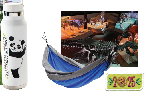
Overnight at Museum of Natural Science (June 20), Hammock and 2025 patch