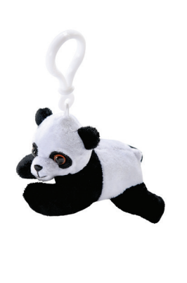
Panda Backpack Clip 200 – 249 packages sold