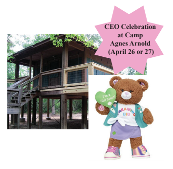
CEO Celebration, $175 Cookie Dough Credit, and Build a Bear Event 1,000 - 1,249 packages sold