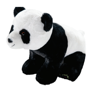
Large Panda Plush 500 – 749 packages sold