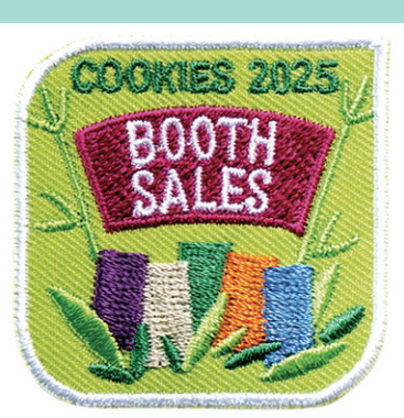
Booth Patch Participate in two booths and use booth divider