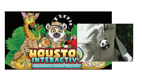
Houston Interactive Aquarium (May 16) & Animal Preserve and Bluetooth Panda Speaker 3,000 - 3,999 packages sold