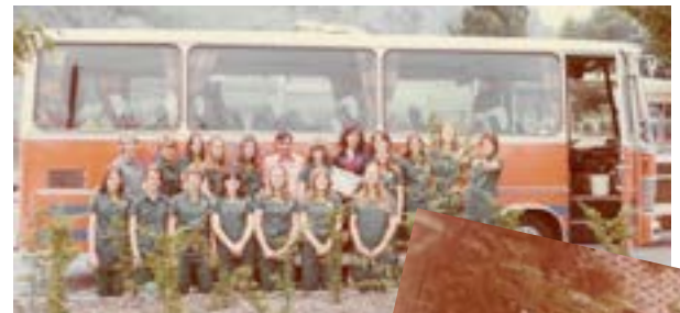
Troop #639 enjoyed traveling all over the world together, including an exciting three-week trip to Europe.