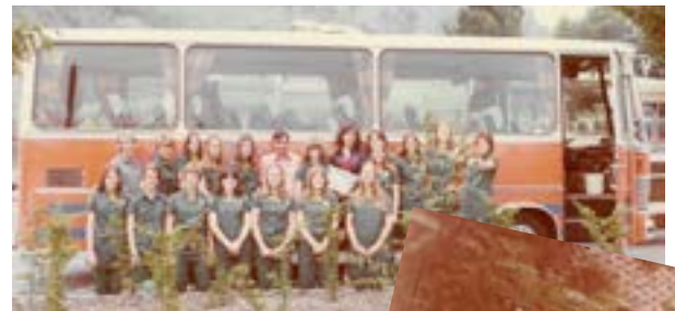
Troop #639 enjoyed traveling all over the world together, including an exciting three-week trip to Europe.